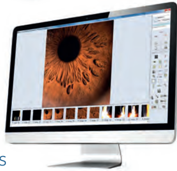
Image Capture Software Options